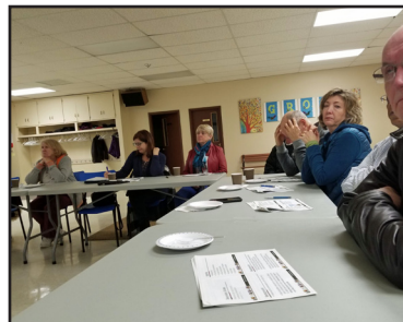
PLA members in attendance

PLA is now on facebook. Please connect with us. www.facebook.com